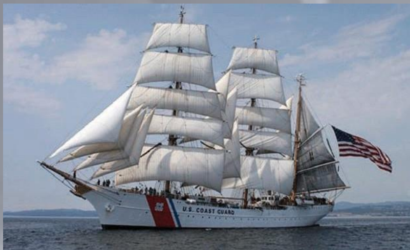
EAGLE under full sail with 22,280 square feet of sail area.

In July I had a once in a lifetime opportunity to travel back in time and to experience again the thrill of sailing on the U.S. Coast Guard's training ship EAGLE. Each summer the EAGLE offers a few berths to a limited number of alumni in the 50-, 40-, and 30-year anniversary classes.