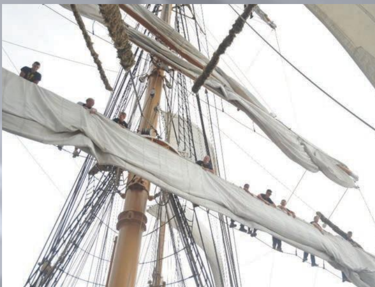
Aloft helping cadets and crew harbor furl sails before arriving in Norfolk. Doug second from the left.