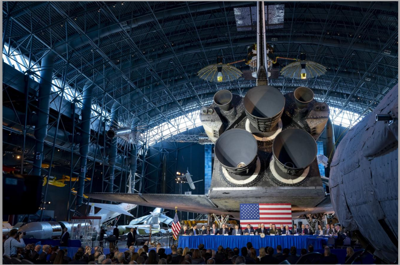
Vice President Mike Pence chairs the Sixth Meeting of the National Space Council at the Smithsonian National Air and Space Museum's Steven F. Udvar-Hazy Center in Chantilly, Virginia, on August 20, 2019.

The policy, program, and resource decisions of the Trump Administration have set the United States on a course to continue its global leadership in space exploration and discovery.