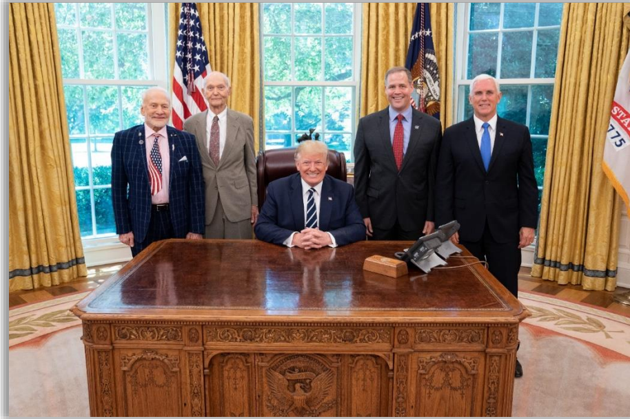
President Donald J. Trump, Vice President Mike Pence and NASA Administrator Jim Bridenstine welcome Apollo 11 astronauts Buzz Aldrin and Michael Collins in the Oval Office to commemorate the 50 th anniversary of the Apollo 11 Moon landing on July 19, 2019.