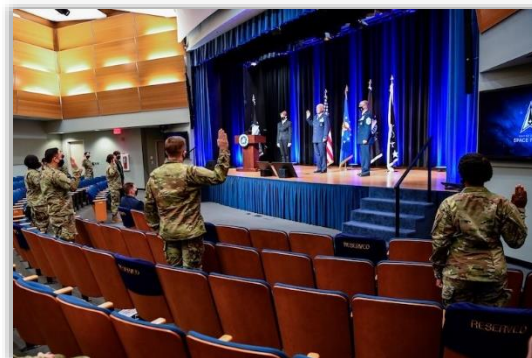
Chief of Space Operations Gen. John W. Raymond administers the oath of office to airmen transferring into the U.S. Space Force during a ceremony at the Pentagon on September 15, 2020.

On February 12, 2020, the President issued an Executive Order on Strengthening National Resilience through Responsible Use of Positioning, Navigation, and Timing Services. This order seeks to protect the national and economic security of the United States and its partners by ensuring reliable and efficient function of the Global Positioning System (GPS) and related critical infrastructure. The United States continues to make GPS services available worldwide as a free service, which has offered immense global value for communications, security, commerce, agriculture, transportation, mobility, weather, and emergency response. However, dependence on this invisible utility and its widespread adoption require protection from disruption and manipulation to ensure national resilience.