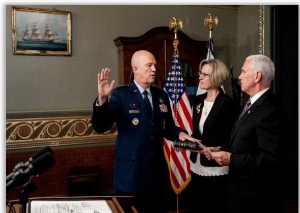
Vice President Mike Pence swears in General John W. "Jay" Raymond as the first Chief of Space Operations for the U.S. Space Force in the Vice President's Ceremonial Office of the Eisenhower Executive Office Building at the White House on January 14, 2020.

develop advantages while U.S. interests in space are contested in this increasingly dynamic environment.