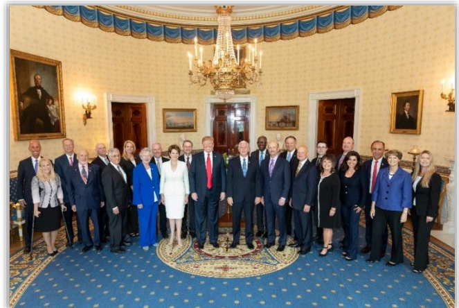
President Donald J. Trump and Vice President Mike Pence with members of the Users' Advisory Group on June 18, 2018, in the Blue Room of the White House.

The Council is supported by the Users' Advisory Group (UAG) , a Federal Advisory Committee composed of senior leaders and subject matter experts from industry, academia, and other non-federal entities representing the broader space community. Members of the UAG are appointed to two-year terms. The first members were appointed in June 2018. New appointments and re-appointments were made in June 2020. Since its first meeting on June 19, 2018, the UAG has regularly convened to provide valuable input to the National Space Council.