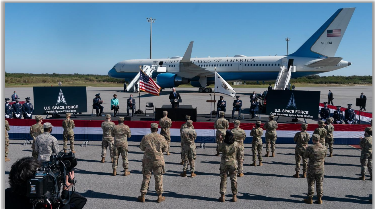
Vice President Mike Pence delivers remarks at a ceremony to re-designate existing U.S. Air Force installations as the first two installations of the United States Space Force at Cape Canaveral Space Force Station on December 9, 2020.

In standing up the newest Armed Service, the U.S. Space Force has achieved a number of significant milestones at a rapid pace: