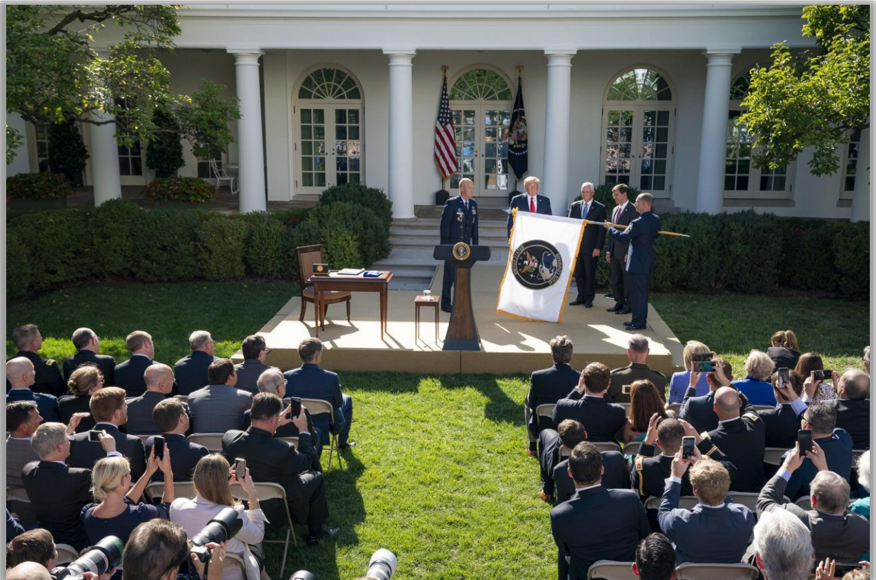
The flag of United States Space Command is unfurled during a ceremony in the Rose Garden at the White House on August 29, 2019.

The reestablishment of the United States Space Command as a Unified Combatant Command and the establishment of the United States Space Force as the sixth branch of the U.S. Armed Forces were significant efforts to effectively defend and protect American interests in all domains.