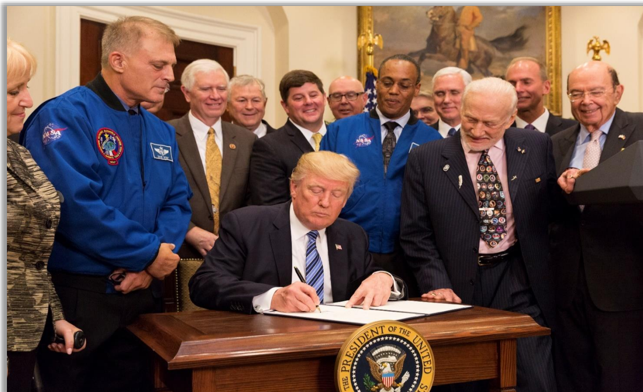
President Donald J. Trump signs Executive Order 13803, Reviving the National Space Council in the Roosevelt Room of the White House on June 30, 2017.