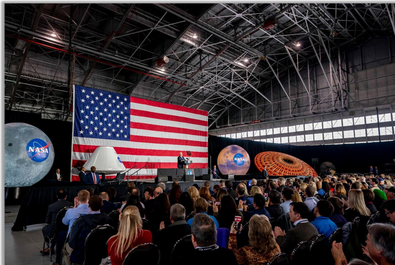
Vice President Mike Pence delivers remarks personnel and guests at NASA's Langley Research Center on February 19, 2020.

To preserve U.S. heritage in space, the Office of Science and Technology Policy issued a report on Protecting and Preserving Apollo Program Lunar Landing Sites and Artifacts in March 2018. This report outlines the global significance of the Apollo Program, and its cultural, scientific, and technological impact more than 50 years later and underlines the importance of the sites as a means to ensure this heritage is accessible to future generations. On July 20, 2019, people all around the globe commemorated humanity's first steps on another world during the celebrations surrounding the 50 th anniversary of the Apollo 11 lunar landing.