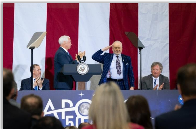
Vice President Mike Pence and Apollo 11 astronaut Buzz Aldrin at the commemoration of the 50 th anniversary of Apollo 11 at NASA's Kennedy Space Center on July 20, 2019.

In addition to elevating public awareness of the mission and achievements of NASA, the National Space Council leveraged the broad array of government expertise at the Departments of State, Defense, Commerce, Transportation, and Energy to strengthen and expand the Nation's civil space enterprise.