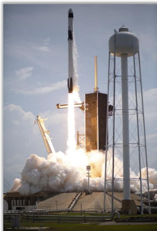
A SpaceX Falcon 9 rocket is launched from Launch Complex 39A for NASA's SpaceX Demo-2 mission to the International Space Station with NASA astronauts Robert Behnken and Douglas Hurley aboard at NASA's Kennedy Space Center on Saturday, May 30, 2020.

extension of U.S. presence from low-Earth orbit, a return to the Moon for a sustainable presence, and missions to Mars and beyond. The report lays out necessary steps to achieve a truly American future in space, recognizing that it is not merely American machines and astronauts that constitute U.S. space activities, but American values as well.