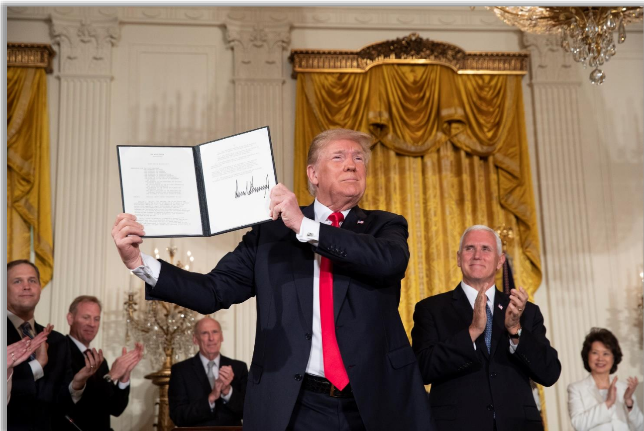
President Donald J. Trump signs Space Policy Directive 3 at the Third Meeting of the National Space Council in the East Room of the White House on June 18, 2018.

thousands. New technological advancements are not only increasing the number of American satellites, but prolonging the operational life of satellites already in orbit. Between February 25, 2020, and April 2, 2020, Northrop Grumman's Mission Extension Vehicle 1 became the first spacecraft to rendezvous with, service, and reposition another satellite to extend its useful life.