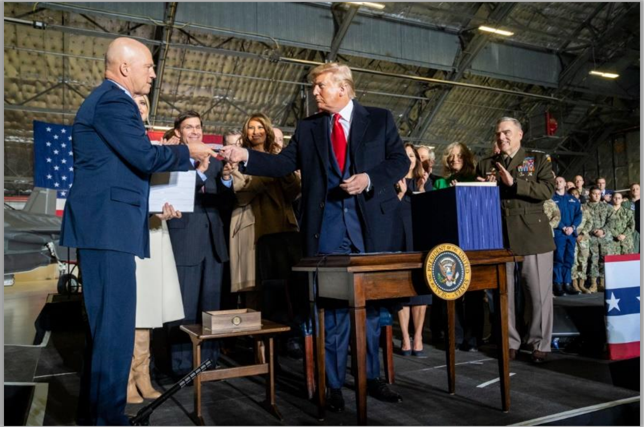
President Donald J. Trump greets General John W. "Jay" Raymond after signing the 2020 National Defense Authorization Act establishing the United States Space Force at Hangar 6 at Joint Base Andrews on December 20, 2019.