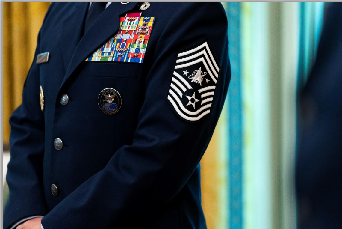
A close up view of the uniform of U.S. Space Force Senior Enlisted Advisor CMSgt Roger Towberman in the Oval Office on May 15, 2020.

On February 12, 2020, the President issued an Executive Order on Strengthening National Resilience through Responsible Use of Positioning, Navigation, and Timing Services. This order seeks to protect the national and economic security of the United States and its partners by ensuring reliable and efficient function of the Global Positioning System (GPS) and related critical infrastructure. The United States continues to make GPS services available worldwide as a free service, which has offered immense global value for communications, security, commerce, agriculture, transportation, mobility, weather, and emergency response. However, dependence on this invisible utility and its widespread adoption require protection from disruption and manipulation to ensure national resilience.