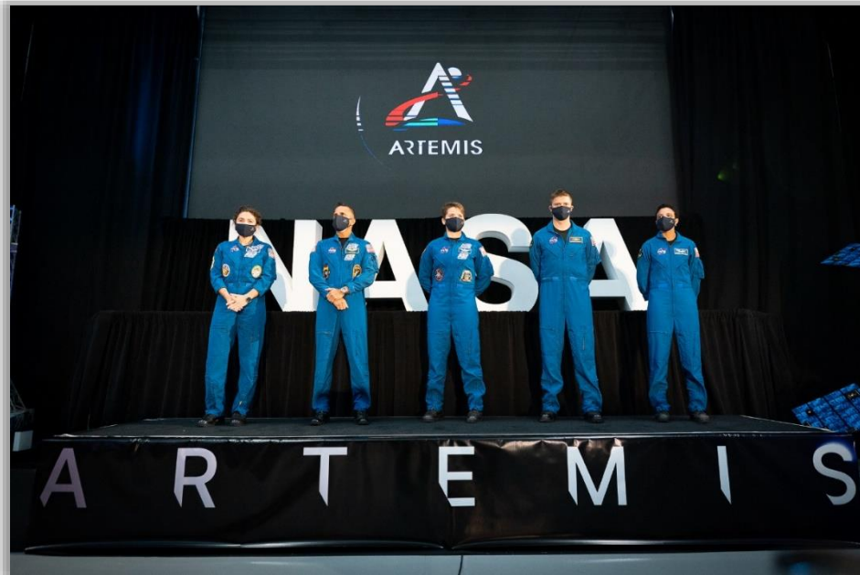
Five members of the first cadre of astronauts for NASA's Artemis Program are recognized after their names are announced by Vice President Mike Pence at NASA's Kennedy Space Center on December 9, 2020.