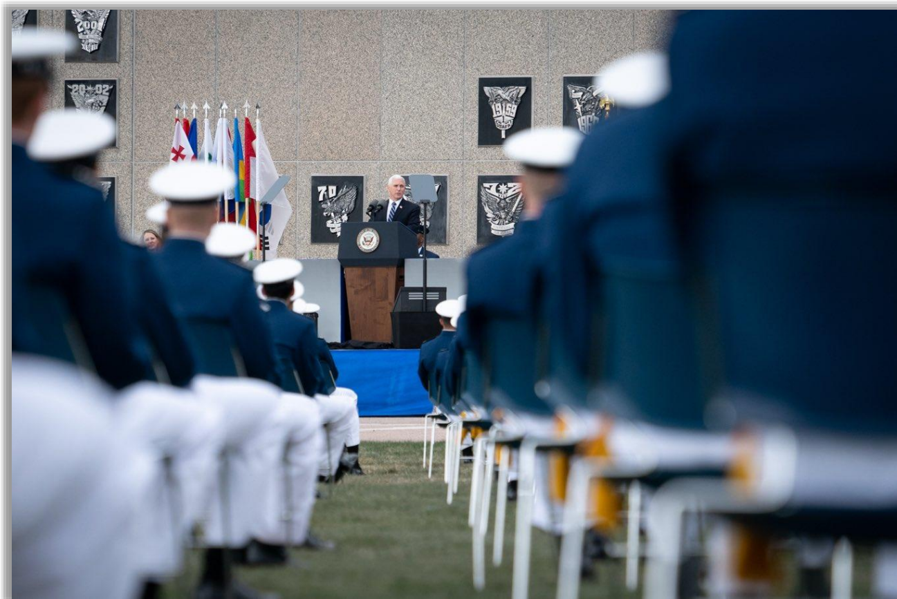
Vice President Mike Pence addresses the U.S. Air Force Academy at its 2020 commencement ceremony, which included the first graduates to be commissioned into the U.S. Space Force at the U.S. Air Force Academy on April 18, 2020.

On December 20, 2019, President Donald J. Trump signed the Fiscal Year 2020 National Defense Authorization Act, a historic piece of bipartisan legislation that formally created the United States Space Force to organize, train, and equip the Nation's space warfighters. The creation of the U.S. Space Force marks the first new military service since the establishment of the U.S. Air Force in 1947. The Administration continues to support the stand-up the U.S. Space Force, including advocating for space operations capabilities and sufficient appropriations, re-designating certain Air Force bases as Space Force bases, accessing and transferring personnel, and developing and implementing new cultural elements of the service.