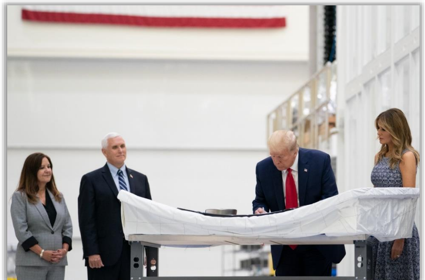
President Donald J. Trump, joined by First Lady Melania Trump, Vice President Mike Pence, and Second Lady Karen Pence, signs a panel from an Orion crew capsule during a tour of NASA's Kennedy Space Center on May 27, 2020.

In order to be sustainable over the long term, U.S. efforts must align space policies, programs, and budgets with enduring national interests that span the political divide. Economic prosperity, national security, science, and foreign policy are all inherently affected by space activities, which provide both practical and symbolic benefits for the United States. The Trump Administration has prioritized national interests in the space domain in concert with core American values: democracy, freedom, the rule of law, and free markets. To advance U.S. national space power and make the world safer and more prosperous, American values must thrive on the next great frontier.