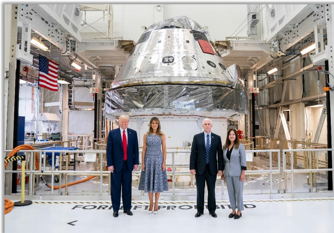
President Donald J. Trump, First Lady Melania Trump, Vice President Mike Pence, and Second Lady Karen Pence in front of the Orion capsule at NASA's Kennedy Space Center on May 27, 2020.

These bold goals were carried forward in the President's Budget Requests, which have resulted in some of the largest NASA budgets since the Apollo Program in the 1960s. Through the Artemis Program, NASA is developing its mission architecture, commercial and international partnerships, and budget requests to ensure the proper resources and programs are in place for sending humans to the surface of the Moon.