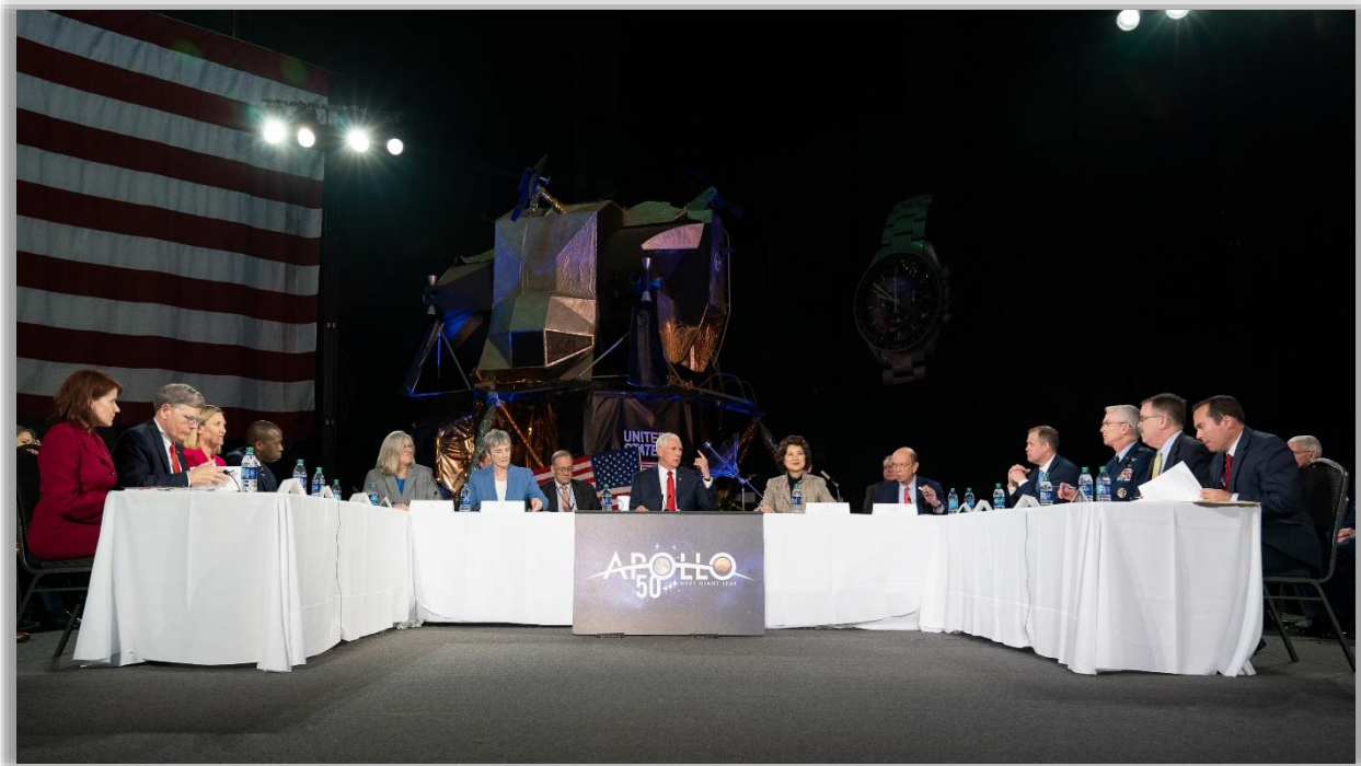
Vice President Mike Pence chairs the Fifth Meeting of the National Space Council at the U.S. Space and Rocket Center in Huntsville, Alabama, on March 26, 2019.

This recommendation paved the way for the first Space Policy Directive on December 11, 2017. Space Policy Directive 1 (SPD-1), Reinvigorating America's Human Space Exploration Program, states that the United States will: