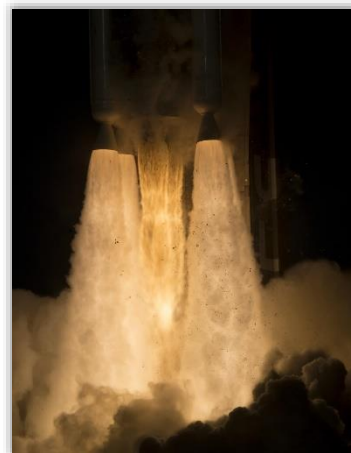
A United Launch Alliance Atlas V rocket with NASA's Mars 2020 Perseverance rover onboard launches from Cape Canaveral in Florida on Thursday, July 30, 2020.

assembly, advanced space-related power and propulsion capabilities, and orbital debris management among specific areas of interest.