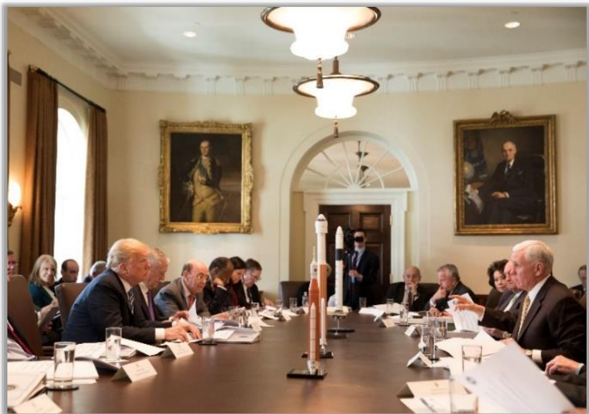
Vice President Mike Pence briefs President Donald J. Trump and members of the Cabinet in the Cabinet Room of the White House on March 8, 2018.