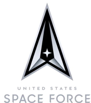
The official seal (L) and logo (R) of the United States Space Force.