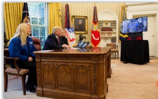
President Donald J. Trump, alongside Ivanka Trump and NASA astronaut Kate Rubins, speaks with NASA astronauts Peggy Whitson and Jack Fischer aboard the International Space Station, in the Oval Office on April 24, 2017, to congratulate Commander Whitson for breaking the record for most time in space of any American astronaut.

“Consistent with the overall goals of SPD-1, the United States will seek to land Americans on the Moon's South Pole by 2024, establish a sustainable human presence on the Moon by 2028, and chart a future path for human Mars exploration. NASA's lunar presence will focus on science, resource utilization, and risk reduction for future missions to Mars.”