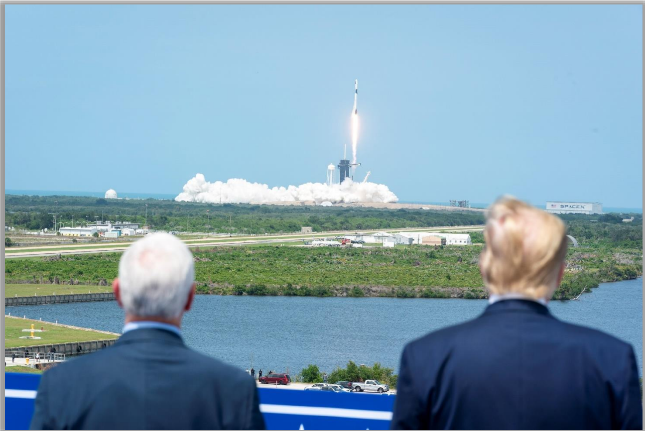
President Donald J. Trump and Vice President Mike Pence attend NASA's SpaceX Demonstration Mission 2 launch for the Commercial Crew Program at NASA's Kennedy Space Center on May 30, 2020.

“We are a nation of pioneers. We are the people who crossed the ocean, carved out a foothold on a vast continent, settled a great wilderness, and then set our eyes upon the stars. This is our history, and this is our destiny.”