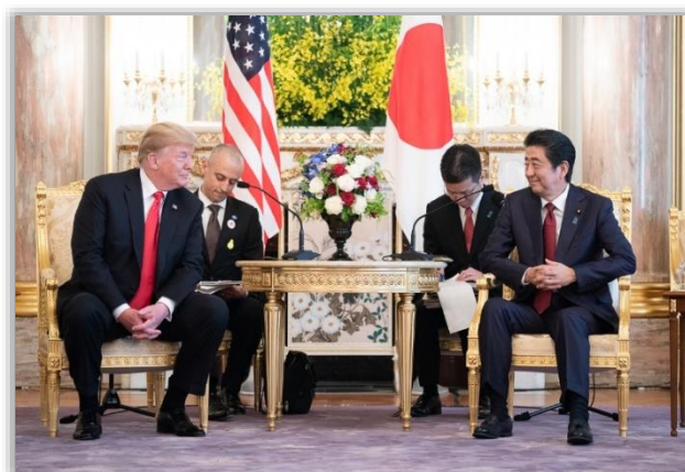
President Donald J. Trump participates in an expanded bilateral meeting with Japan's Prime Minister Shinzo Abe Monday at the Akasaka Palace in Tokyo on May 27, 2019.

On May 27, 2019, as part of the Japan-U.S. Summit in Tokyo, Prime Minister Shinzo Abe and President Donald J. Trump agreed to dramatically expand U.S.-Japan cooperation in human space exploration through the U.S.-led Artemis Program. The agreement was the culmination of years of increased cooperation between the United States and Japan in space science, space security, commercial space, and human spaceflight. On November 15, 2020, Japanese astronaut Soichi Noguchi became the first international member of NASA's Commercial Crew Program when he launched with American astronauts from Kennedy Space Center. On December 15, 2020, the United States and Japan signed an agreement to launch one hosted payload on Japan's Quasi-Zenith Satellite System. Finally, on December 28, 2020, the United States and Japan signed an agreement for cooperation on the Artemis Gateway.