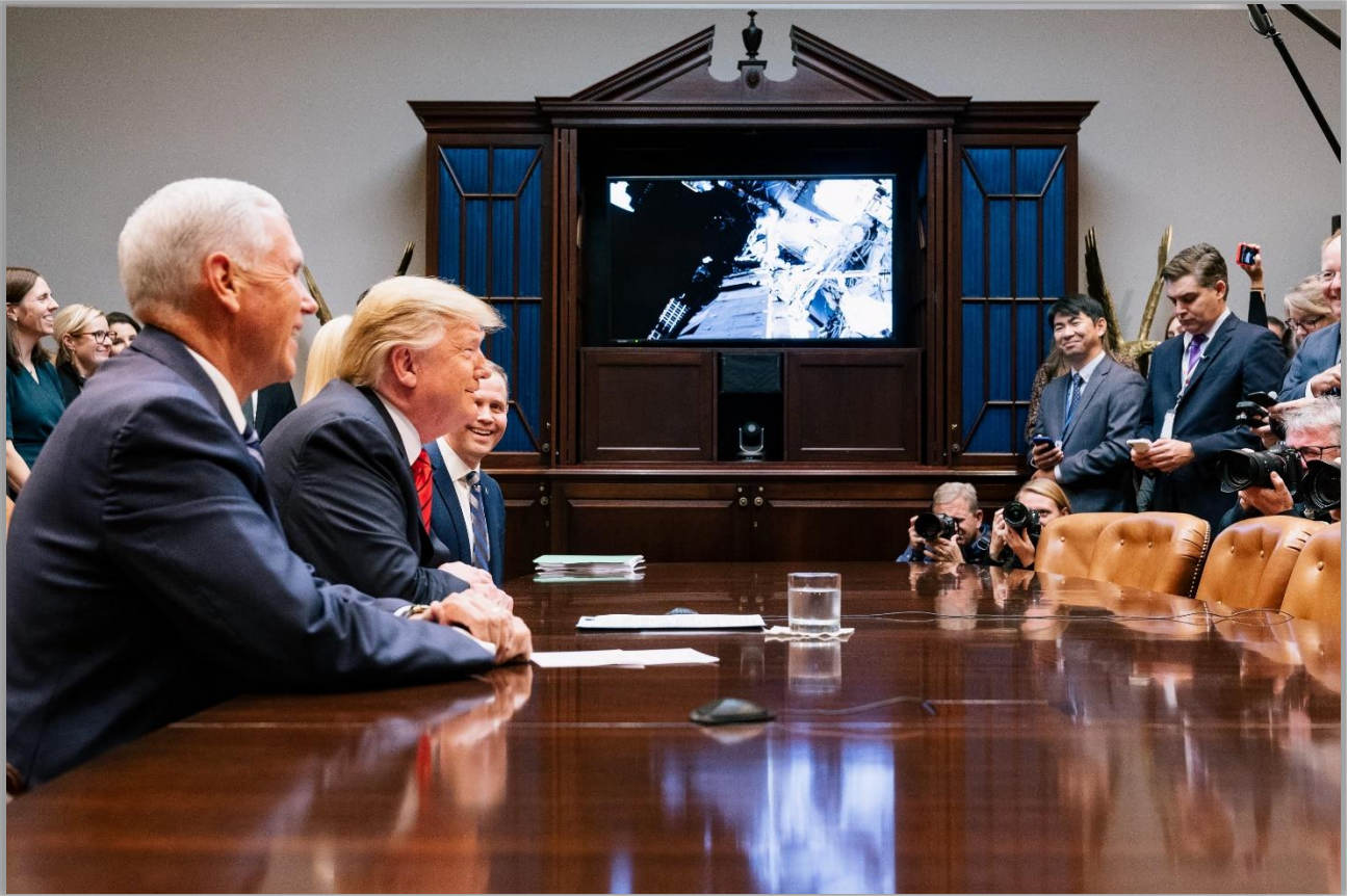
President Donald J. Trump speaks with NASA astronauts Christian Koch and Jessica Meir via satellite uplink during the first ever all-female spacewalk in the Roosevelt Room of the White House on October 18, 2019.

released the National Strategy for Planetary Protection . The strategy guides implementation of direction from the National Space Policy to develop objectives related to planetary protection in a manner that balances the Nation's interests in safety, scientific discovery, human exploration, and commercial activity in space.