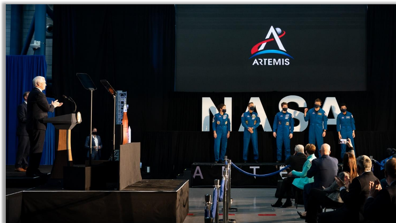
Vice President Mike Pence announces the names of the first cadre of astronauts for NASA's Artemis Program at NASA's Kennedy Space Center on December 9, 2020.