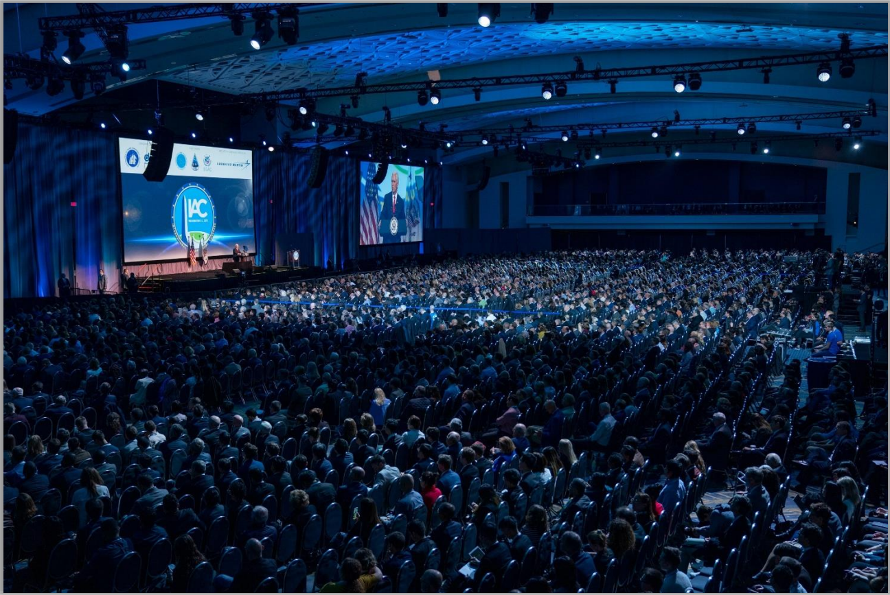
Vice President Mike Pence delivers remarks at the International Astronautical Conference at the Walter E. Washington Convention Center in Washington, D.C., on October 21, 2019.