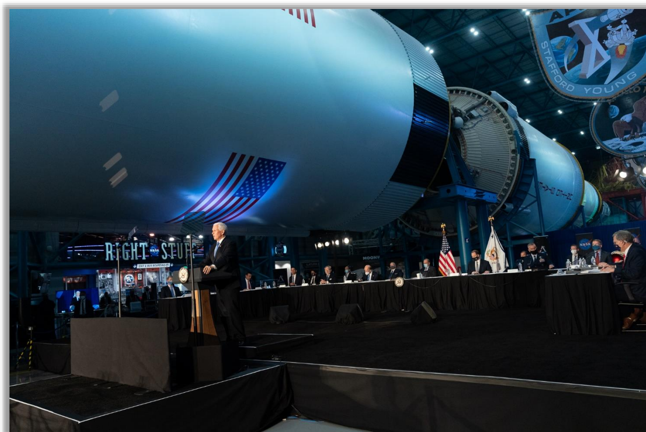
Vice President Mike Pence delivers remarks and chairs the Eighth Meeting of the National Space Council at NASA's Kennedy Space Center on December 9, 2020.