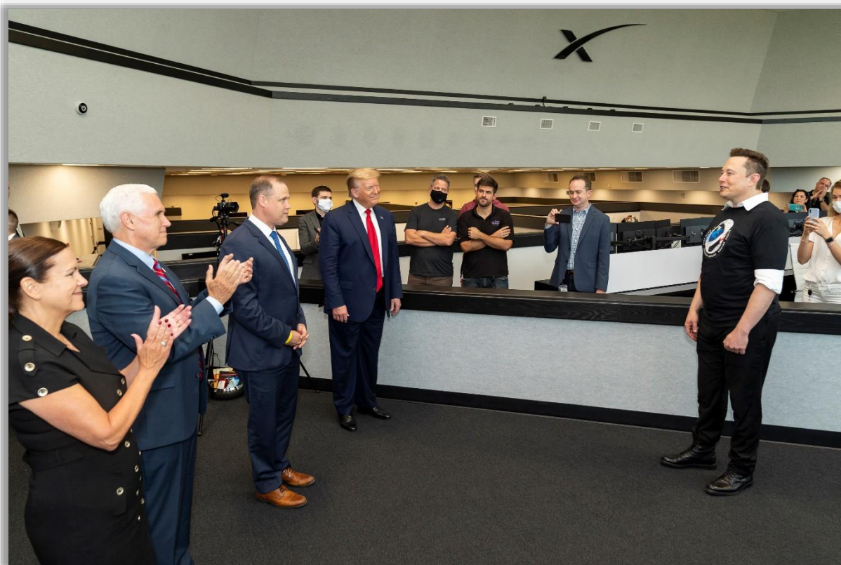
President Donald J. Trump, Vice President Mike Pence, Second Lady Karen Pence, and NASA Administrator Jim Bridenstine applaud SpaceX founder and CEO Elon Musk after the successful SpaceX Demonstration Mission 2 launch at NASA's Kennedy Space Center on Saturday, May 30, 2020.

In November 2020, NASA marked the twenty-year anniversary of continuous crewed operations on the International Space Station. Noting this remarkable achievement, prudent steps are being taken to prepare for the future of U.S. presence in low-Earth orbit once this national asset reaches its inevitable retirement. By harnessing American ingenuity and entrepreneurship, the United States is planning for a future that will involve multiple orbital platforms, at least some of which will be commercially operated. The United States foresees a future requirement for research, technology development, and crew training in low-Earth orbit, and is taking measures to increase commercial activity in this domain, which will allow the government to devote these resources to other critical exploration priorities.