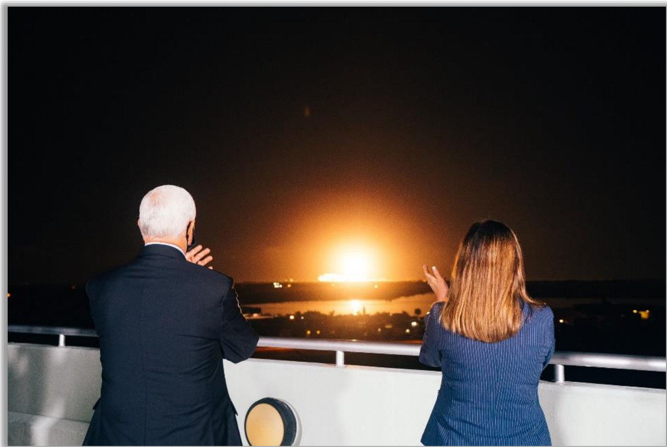
Vice President Mike Pence and Second Lady Karen Pence watch the launch of NASA's SpaceX Crew-1 Mission at NASA's Kennedy Space Center on November 15, 2020.