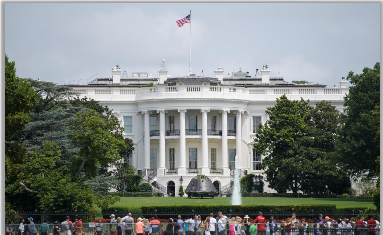
NASA's Orion spacecraft, produced by prime contractor Lockheed Martin, is seen on the South Lawn of the White House on July 22, 2018.